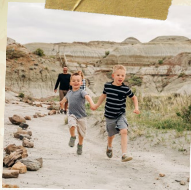
Dinosaur Provincial Park

Eat, drink and play your way through the Brooks Region!